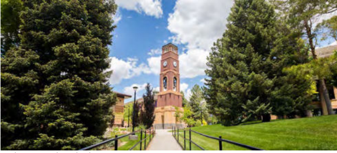
Pathway to the Clock Tower