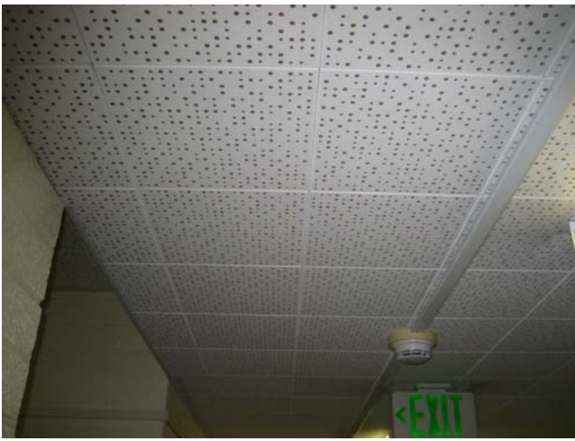
Photograph 1-SUU ENGINEERING & TECHNOLOGY BUILDING Non-ACM, 12" ceiling tile random dot pattern