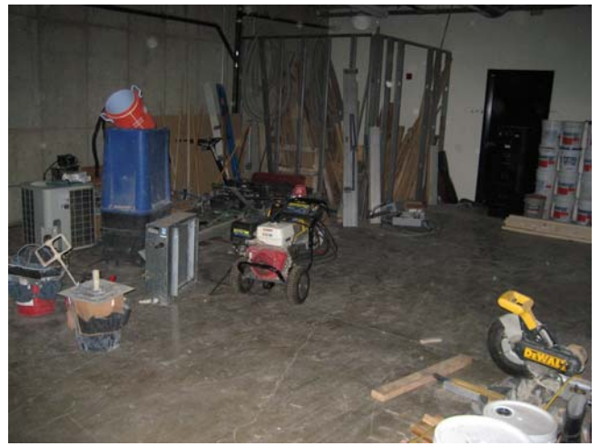
Photograph 2-SUU ENGINEERING & TECHNOLOGY BUILDING Room 005B storage.