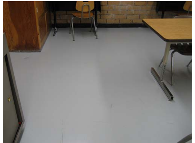
Photograph 16-SUU ENGINEERING & TECHNOLOGY BUILDING Room 112-Electronics Lab floor, non-ACM.