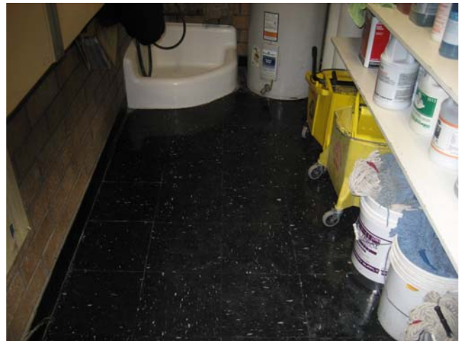
Photograph 10-SUU ENGINEERING & TECHNOLOGY BUILDING M004: ACM 12" floor tile, room 104 Custodial Closet.