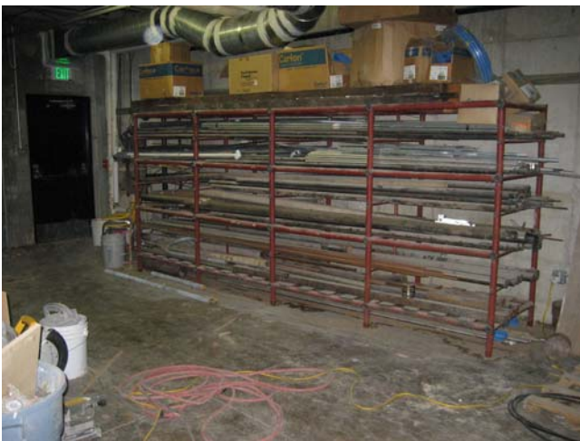
Photograph 3-SUU ENGINEERING & TECHNOLOGY BUILDING Room 005B storage.