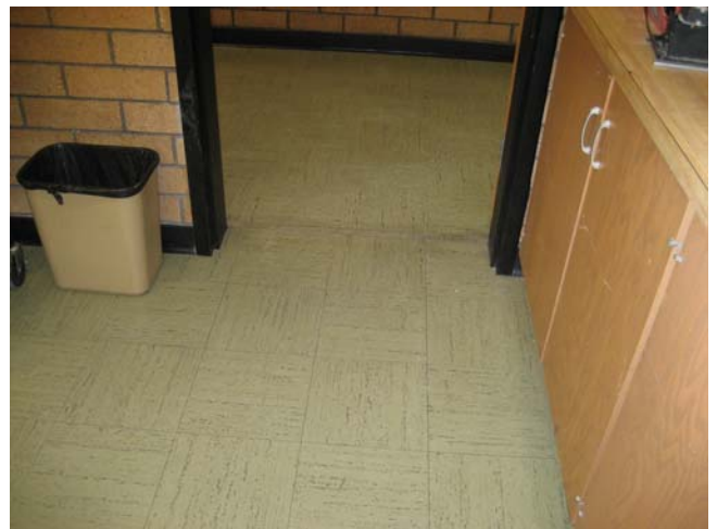
Photograph 4-SUU ENGINEERING & TECHNOLOGY BUILDING M002: ACM 12" floor tile, room 119 Graphics Lab.