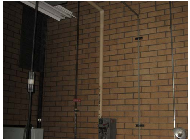
Photograph 8-SUU ENGINEERING & TECHNOLOGY BUILDING T001: ACM TSI joints/fittings, room 101B Machine Shop.