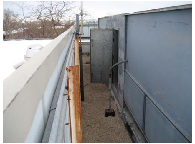
Photograph 14-SUU ENGINEERING & TECHNOLOGY BUILDING M005: ACM Roof (built-up w/rock ballast).