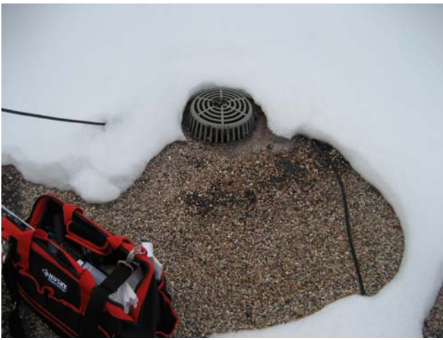
Photograph 13-SUU ENGINEERING & TECHNOLOGY BUILDING M005: ACM Roof (built-up w/rock ballast).