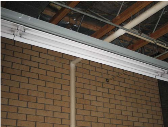
Photograph 9-SUU ENGINEERING & TECHNOLOGY BUILDING T001: ACM TSI joints/fittings, room 101B Machine Shop.