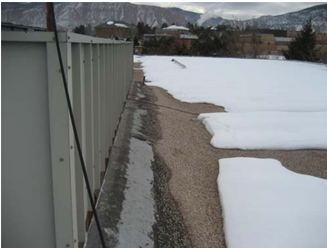
Photograph 15-SUU ENGINEERING & TECHNOLOGY BUILDING M005: ACM Roof (built-up w/rock ballast). Black & Silver tar sealant.