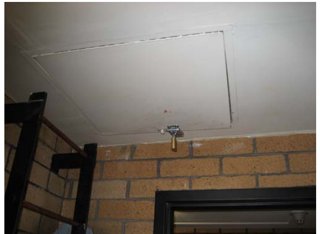
Photograph 12-SUU ENGINEERING & TECHNOLOGY BUILDING Room 104-Custodial Closet; access to roof hatch.