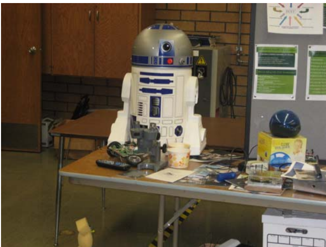
Photograph 5-SUU ENGINEERING & TECHNOLOGY BUILDING R2D2