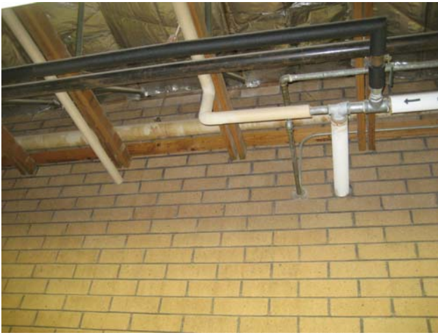
Photograph 7-SUU ENGINEERING & TECHNOLOGY BUILDING T001: ACM TSI joints/fittings, room 106 Wood Lab.