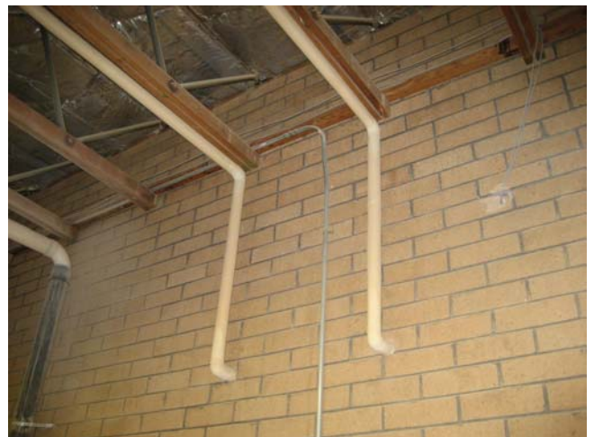
Photograph 6-SUU ENGINEERING & TECHNOLOGY BUILDING T001: ACM TSI joints/fittings, room 106 Wood Lab.