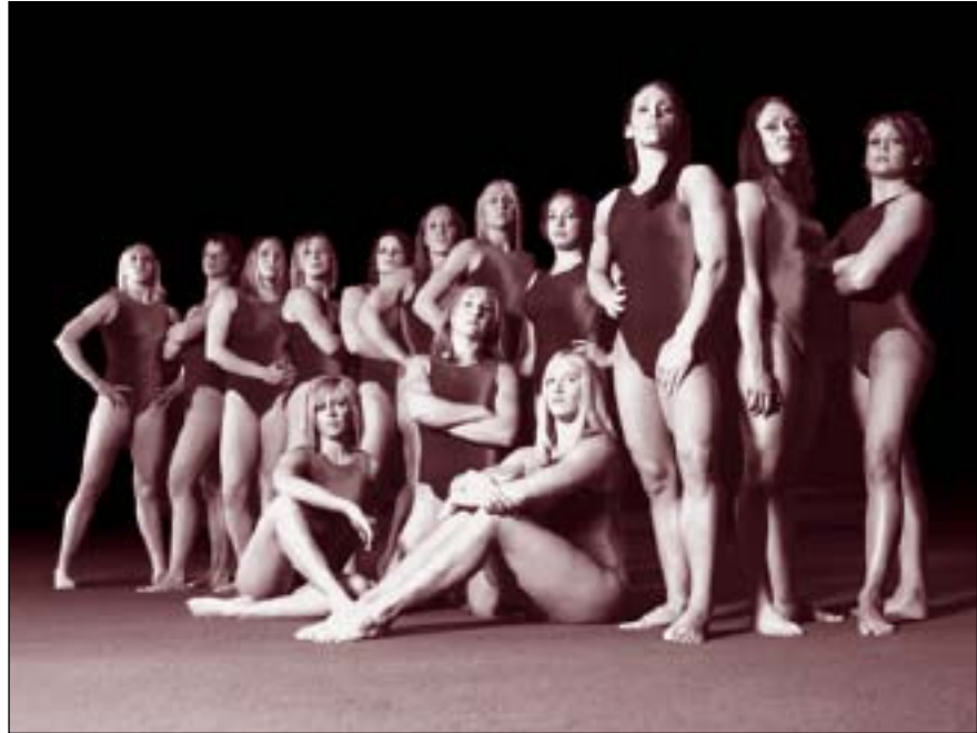
The 2003-04 SUU Gymnastics team.