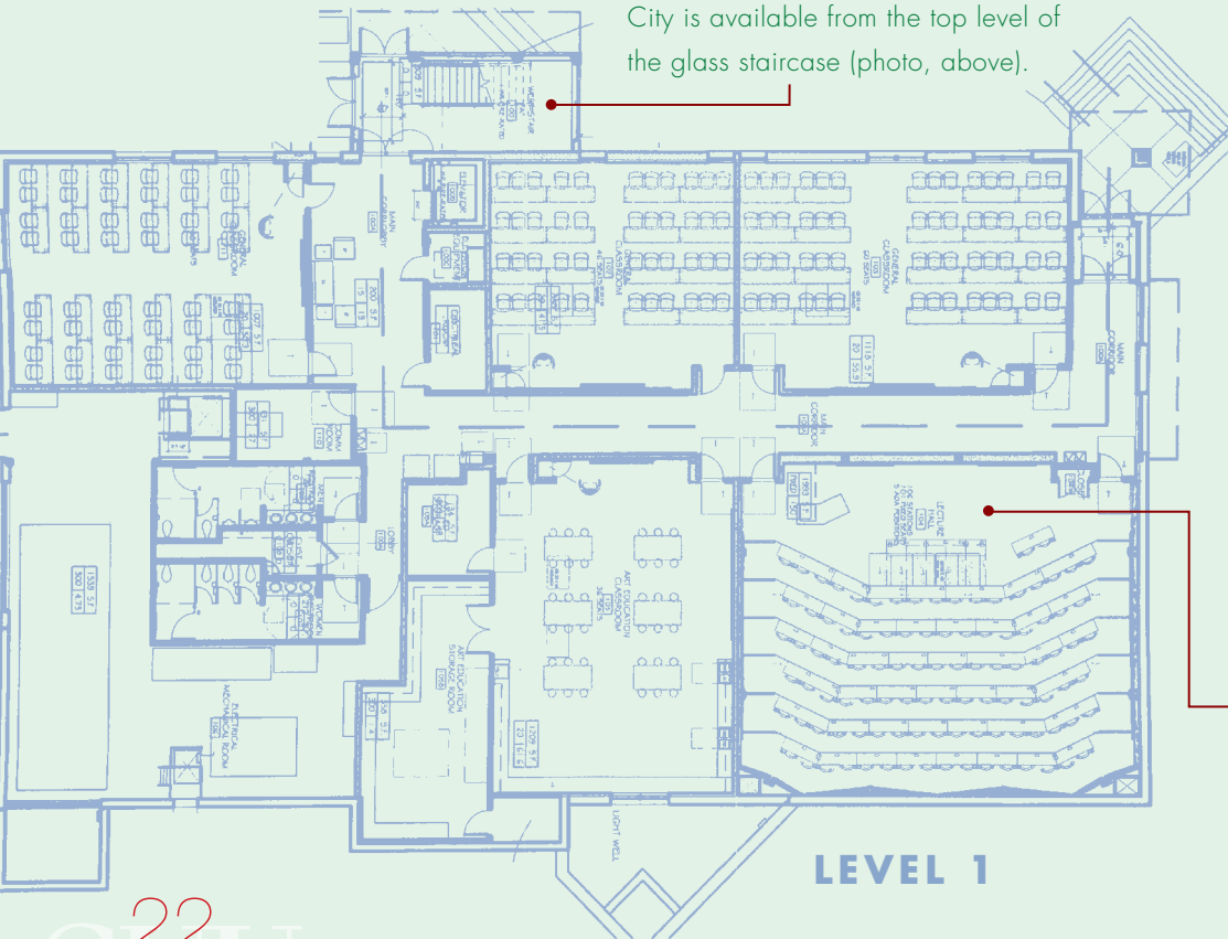
(left) Level one contains a large lecture hall, the art education classroom, general classrooms, and maintenance/utility spaces.