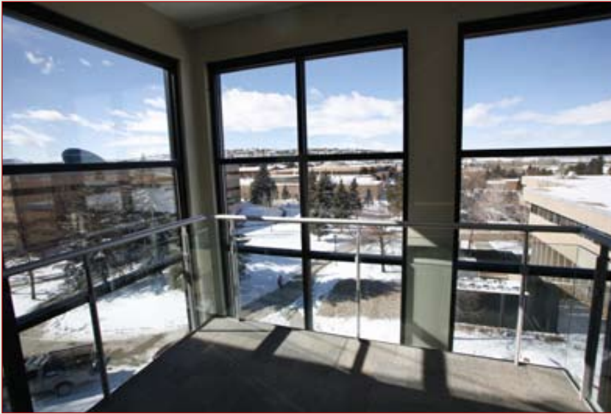
An expansive view of SUU and Cedar City is available from the top level of the glass staircase (photo, above).