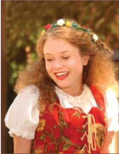
The popular (and free) Greenshow is performed every evening before scheduled plays.

family, love and loyalty in the world-famous musical Fiddler on the Roof ; and they will outright howl with laughter at the antics of the hilarious characters in Moliere's classic farce, The School for Wives .