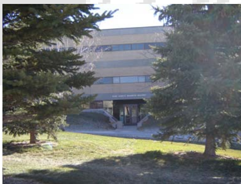
Dixie Leavitt Business Building

The day was a great success and advisors are looking forward to doing another recruitment day similar to this, next year.