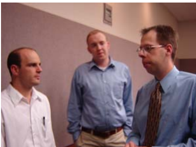
Deloitte and Touche Dinner