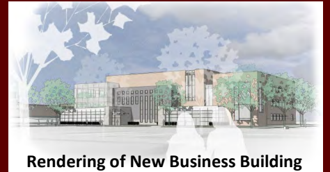
Rendering of New Business Building