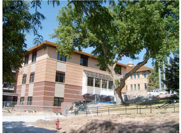
Emma Eccles Jones Teacher Education Building and Old Main Renovation

Work on these two projects is ahead of schedule with the Old Main project being completed by October, 2007 and the new building by December, 2007. It is anticipated that the College will occupy these two buildings in December of 2007 with classes coming online in January, 2008. The building dedication is scheduled for March 14, 2008. (See page 2.)