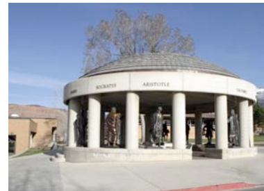
The SUU Centurium

For more information on course offerings, please contact the SUU Office of Graduate Studies in Education, (435) 865-8383.