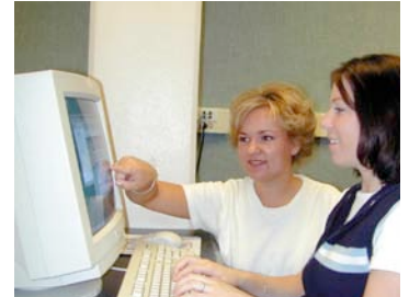
The SUU "Master Teacher eAcademy" begins in August, 2005