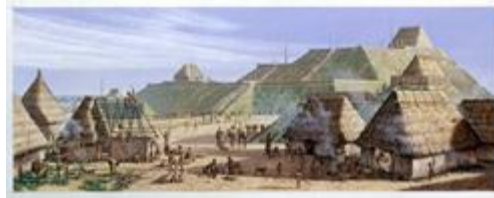
Reconstruction of Cahokia, c. 1250 A.D.*

Abrupt rise of Cahokia, near modern St. Louis, the largest city north of the Rio Grande. Population estimates vary from at least 15,000 to 100,000.