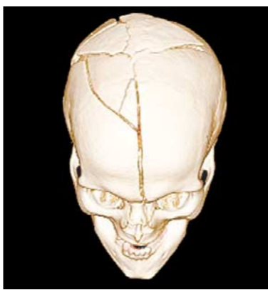
An image from a virtual autopsy of a skull fractured by a falling tree.

Use of virtual autopsies is scarce, but some forensic pathologists in the U.S. are already using