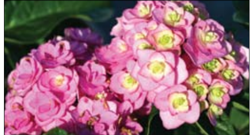
GARDEN SPLENDOR / THE WASHINGTON POST

Instead of spreading synthetic fertilizers, often made from petroleum and sewage sludge, go organic. Organic lawn fertilizers made from kelp and bone meal are high in nitrogen. Seaweed-based products provide "vitamins" and nutrients to lawns and plants. Bone meal is high in phosphorus. Corn meal gluten naturally prevents weeds and crabgrass. Most of these products are available at landscape supplies in various forms. Ask around. Make some calls. And mowing the lawn taller reduces the need for water during dry periods and prevents the growth of crab grass.