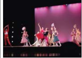
Students perform in the Faculty Dance Concert, Journeys, in the SUU Auditorium. The dance concert took place on Wednesday night.