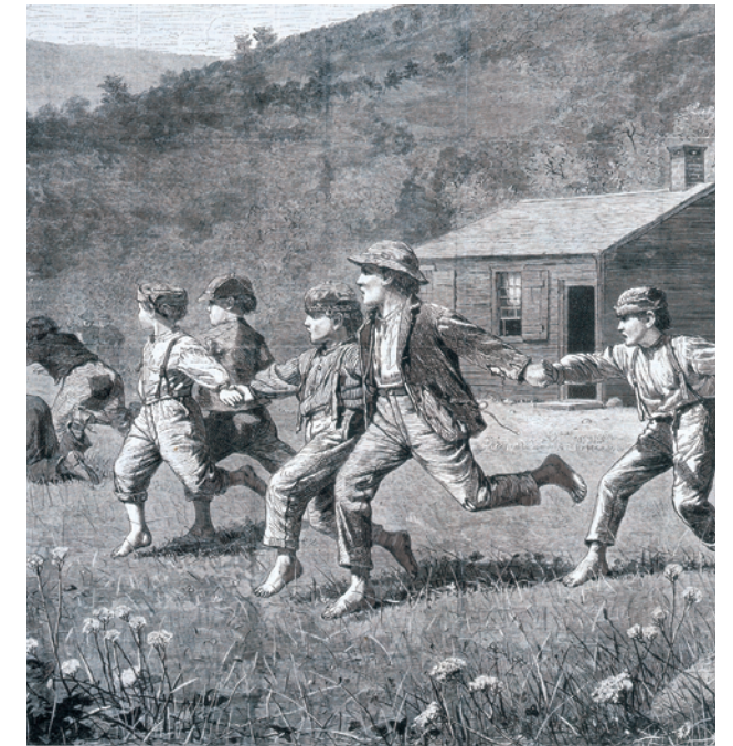
Snap the Whip | Winslow Homer