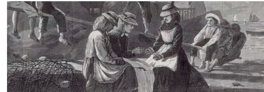
See-Saw-Gloucester, Massachusetts | Winslow Homer