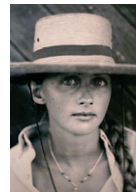
The striking image of a rancher's 15-year-old daughter from Elko, Nevada, was taken by Robb Kendrick in September 2003, using the historic tintype, or ferrotype, process