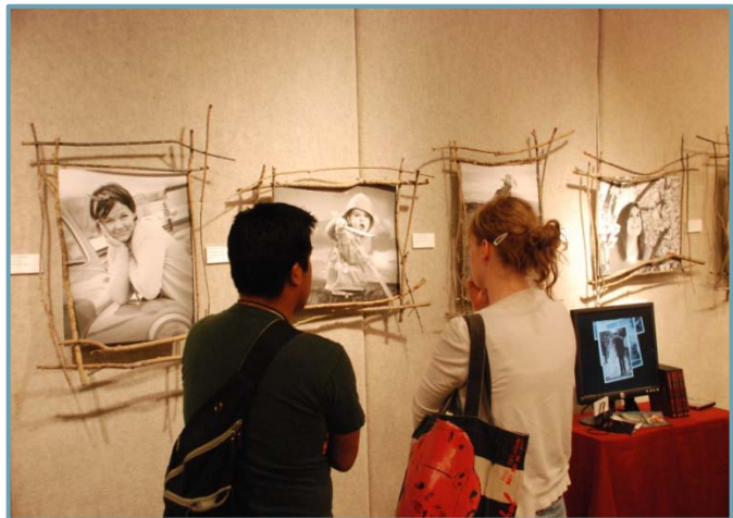
Figure 8 BFA Senior Portfolio Exhibit - Apr 2009

The fall Braithwaite Fine Arts Gallery 2008-09 schedule included the wildly successful In Focus: National Geographic Greatest Portraits exhibit, which broke all attendance records at the gallery. Over 7,300 people visited the gallery including 2,600 schoolchildren who participated in our education program September 11 - November 15, 2008. Grant support from the MetLife Foundation, Cedar City RAP Tax, Utah Arts Council and the Friends of the Braithwaite Fine Arts Gallery helped ensure over 100 school groups were able to take full advantage of this stunning exhibit.