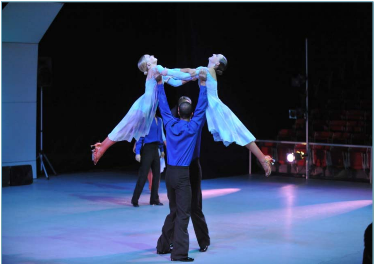
Figure 16 - SUU Ballroom Dance - That's Entertainment - Centrum April 2009