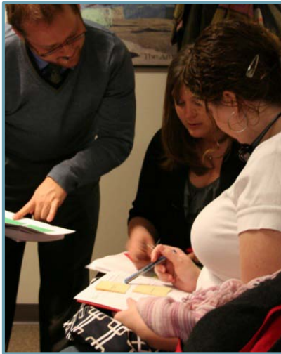
Figure 13 - Arts Administration Students checking their notes

The summer of 2009 marks the last stop towards graduation for SUU's Arts Administration students pursuing their MFA degrees. This year's five graduates have spread out all over the country to complete their final Capstone Internships, serving a wide variety of national and regional professional arts organizations. Upon completion, they will return to defend their degrees and to present their findings and experiences to the campus community on August 20, 2009.