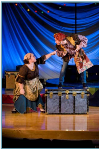
Figure 9 USF Education Tour - Twelfth Night

Photos from ten seasons of the Utah Shakespearean Festival are featured in Ronald Waiinscott's and Kathy Fletcher's third edition textbook entitled Theatre: Collaborative Acts published by Allyn and Bacon.