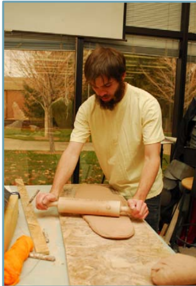
Figure 2 Ceramics Class