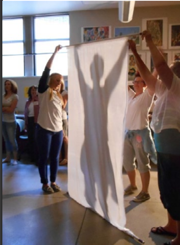
Dancing with shadows above and white paper texture sculptures with shadows below