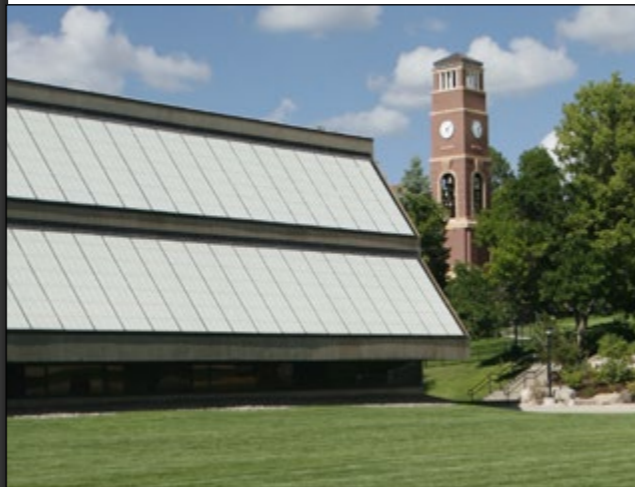
Dixie Leavitt Business Building with The Carter Carillon in the background