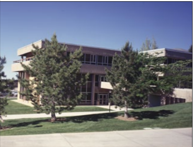
Bennion Administration Building