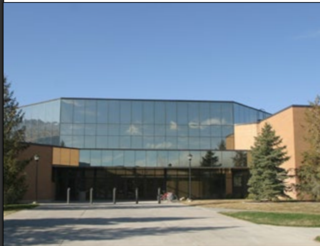
Centrum Arena North Entrance