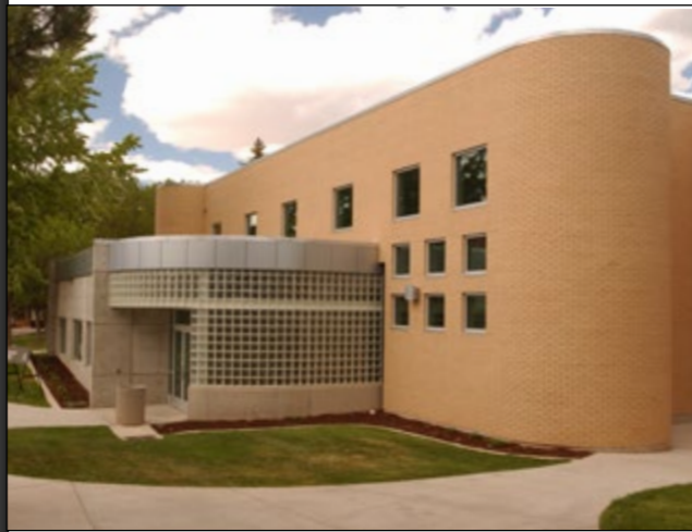
South Hall West Entrance