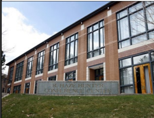
R. Haze Hunter Conference Center