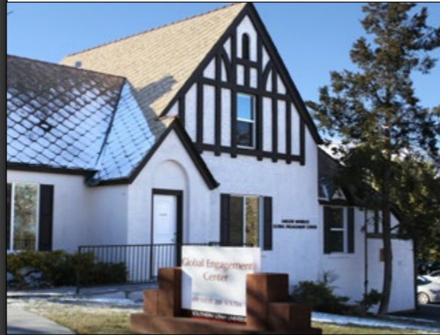
Sargon Heinrich Global Engagement Center