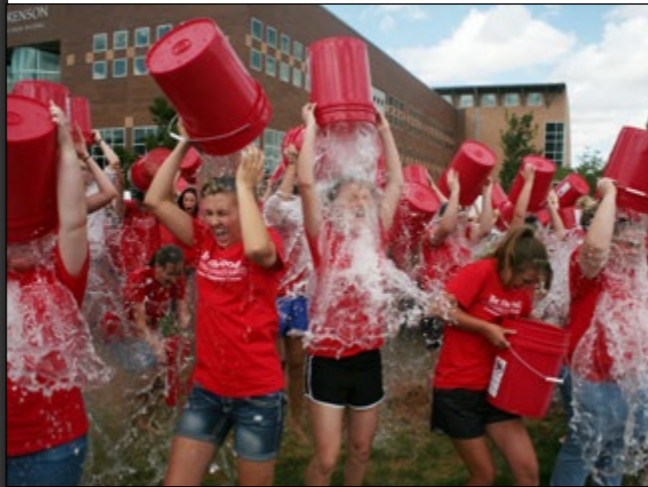
SUU Freshman Participation in the ALS Ice Bucket Challenge