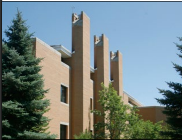
SUU Science Building