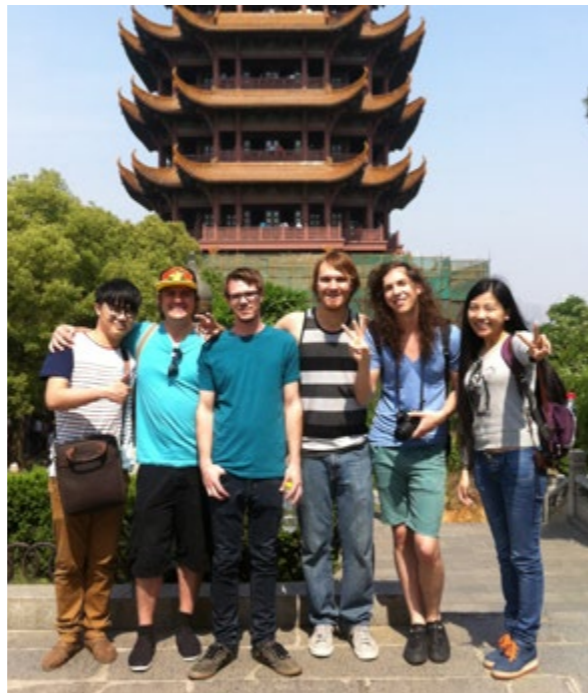
SUU percussion students at Yellow Crane Tower, Wuhan.

Through collaboration with SUU, the Department of Theatre Arts and Dance, and the Utah Shakespeare Festival, an official Student Fellowship program was initiated for SUU theatre students engaged in internships with USF.