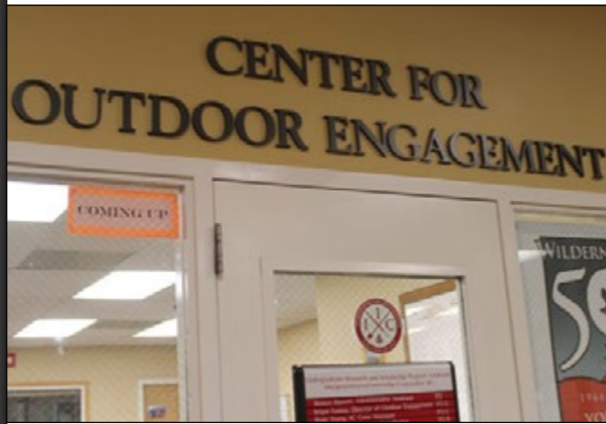
Outdoor Engagement Center