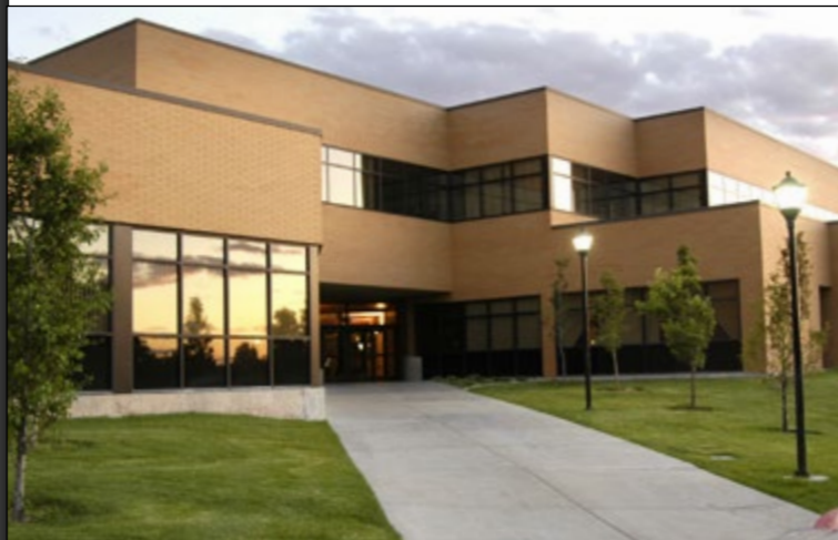
Sharwan Smith Student Center