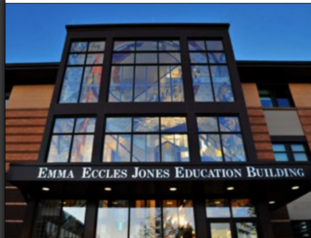
Emma Eccles Jones Education Building West Entrance