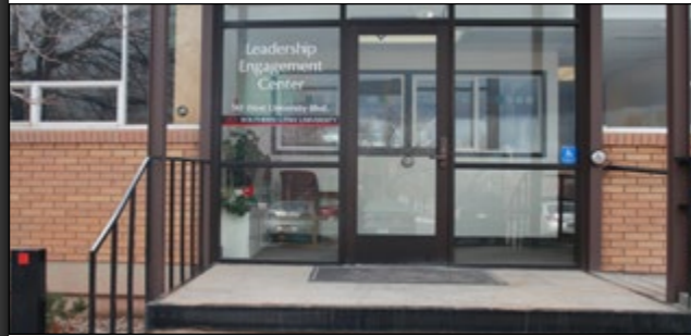
Leadership Engagement Center