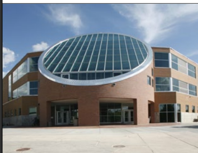
Gerald R. Sherratt Library