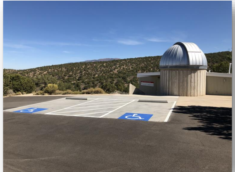
Observatory Road Paving Project