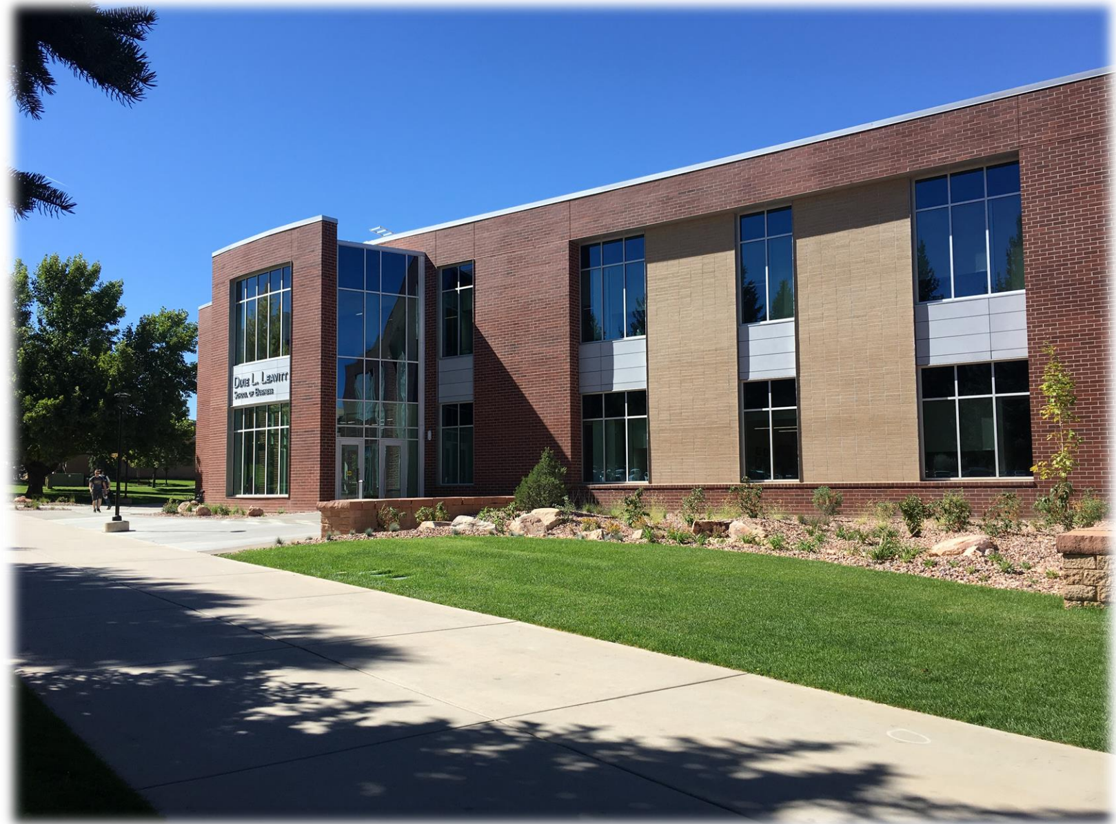
New Business Building