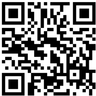
Scan image with cell phone camera

Request a retirement account review or information on our upcoming webinars: