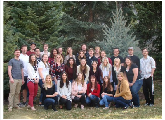
Level One - Class of Spring 2018

We are off to a great start! Our level 1 class is filled with a wide variety of personalities which makes for a fun environment. Since the SUU Nursing Program is small, it gives each of us the opportunity to have the one on one attention of the instructors that most larger programs lack. The level 1 class has already built strong supportive relationships with one another. My classmates and I are really enjoying the hands on aspect of nursing and love seeing how the skills we learn in lab help us develop our individual practice. We are looking forward to the good times as well as the difficult ones that lie ahead as we grow as a group to become great nurses.