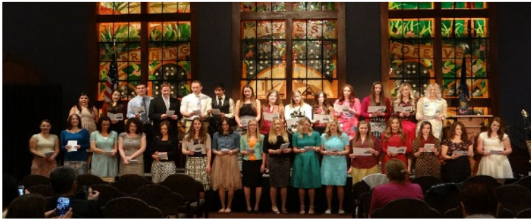
Level Two - Class of Fall 2017

Level 2 has been an intense and exciting semester for us! We are studying medical surgical, pharmacology, and mental health nursing this semester. We recently took our first ATI test of the semester and everyone did amazing! Our hard work is beginning to show! We also recently had the opportunity to help with Southern Utah Universities Health Fair where we were able to share valuable health education to staff and students. We can't believe how fast the semester is going and some are looking forward to becoming Licensed Practical Nurses this winter! We all keep working hard and are excited to be Registered Nurses when we graduate!