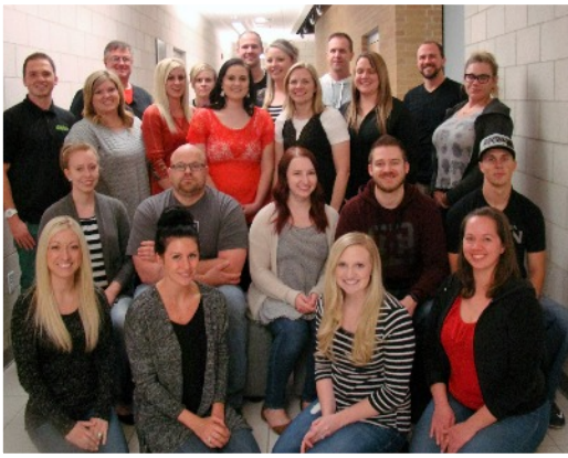
RN to BSN Class of May 2017