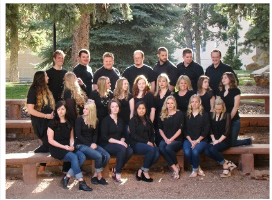
Level Four - Class of Fall 2016

Level 4's are finishing strong! We have continued to stay busy with preceptorship, high acuity clinicals as well as our leadership and current issues classes. We really love the independence that we have had this semester and can't believe it has already flown by! We recently worked to gain our Advanced Cardiovascular Life Support (ACLS) and will soon be getting our Pediatric Advanced Life Support (PALS). We also really enjoyed preparing for Alumni Day and felt the nostalgia of visiting with all the nurses who have gone before us! We are eagerly preparing for graduation and trying to study for the hefty NCLEX-RN. It's a wonderful and scary thought that soon we will be newly graduated nurses, trying to thrive as RN's instead of students! We are super grateful to everyone who have helped us to make it this far!