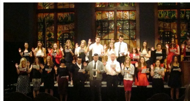
Level Three Class of Spring 2017

Our class is so excited to be in level 3 and in our last year of nursing school. This semester we have continued to bond as a class and have been able to support each other in learning and developing our nursing skills. Many of our class members are working as LPNs and we are excited for the day when we will be able to add the credentials RN after our names. Our class is thoroughly enjoying our clinical rotations bringing life into the world and caring for the family unit. Many of our classmates have found their niche in these departments. We have also enjoyed learning about community nursing and caring for the geriatric population. SUU faculty continues to support and encourage us to be the best we can be and provides opportunities for us to do so. We are so appreciative of their hard work in our behalf. If our class could offer one piece of advice to fellow nursing students, it would be to do your best and work hard because you never know what future opportunity might come because of it.